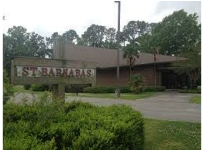
St. Barnabas Episcopal Church 400 Camellia Blvd, Lafayette, LA 70503