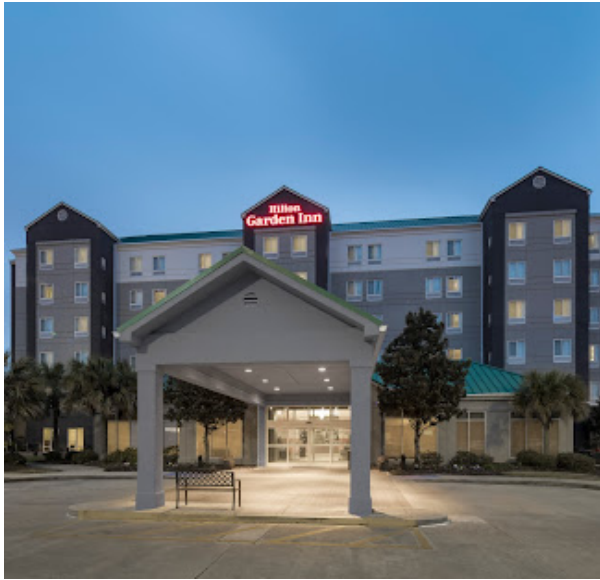
Hilton Garden Inn Lafayette/Cajundome 2350 W Congress St, Lafayette, LA 70506